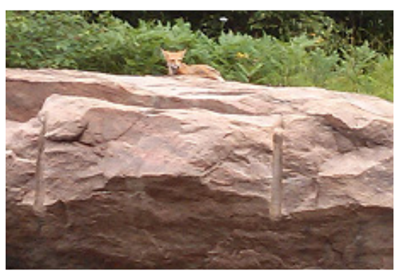
A red fox kept a wary eye on us

Suggestions, recipes (for camping & back country trips), articles or anything else you feel is suitable would be welcome. Obviously we can't guarantee everything we see will be published, but we'll try. Due to potential copyright issues, only photos taken by the editor can be published in the Newsletter.