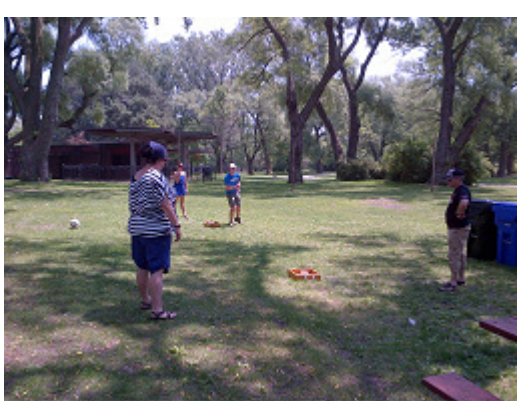
As we tossed