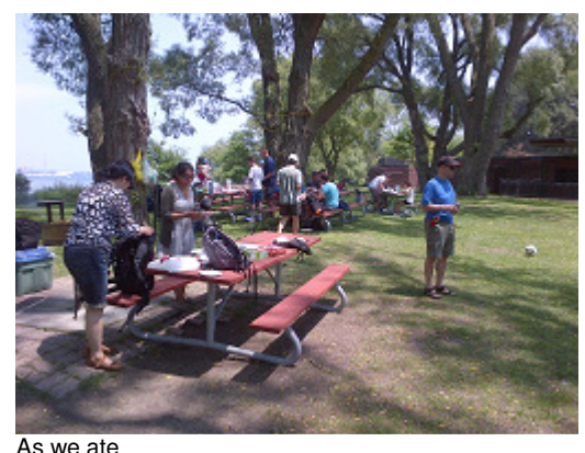
As we ale