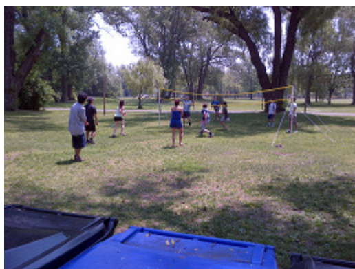
As we played

We post event photos and other items of interest to our members.