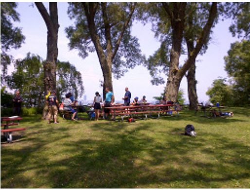
As we gathered

Dining and socializing were the primary activities, but there was some physical play as well thanks to members bringing Frisbees, a Volleyball set and a homemade Beanbag toss kit.